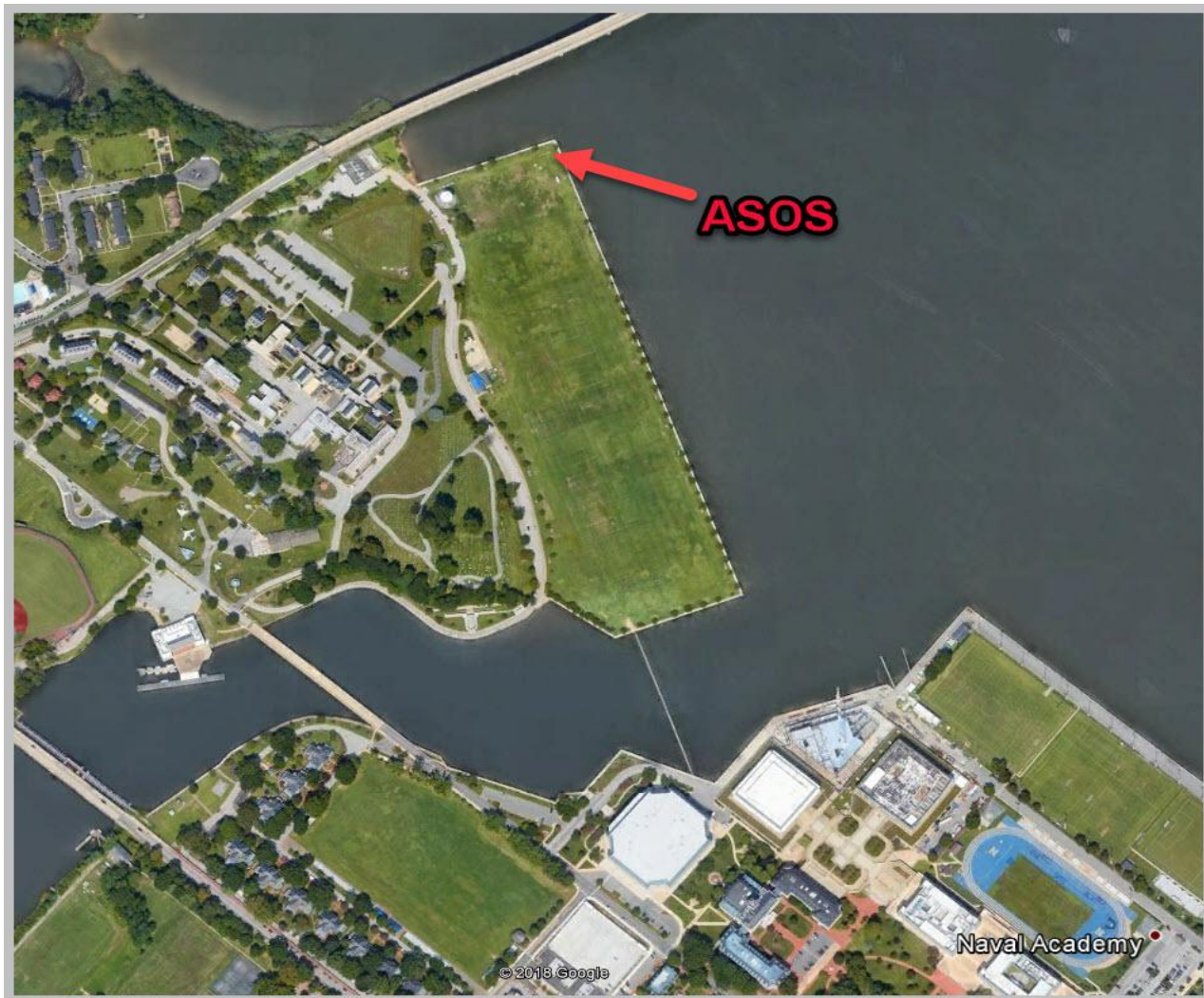
Annapolis ASOS station location - per Google Earth